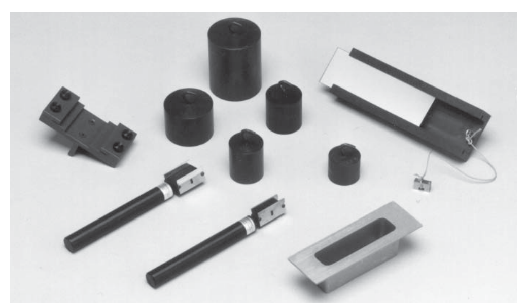
Clockwise from top: Test Weights, QSF-100, WV-100, SC-050, SC-100, LTF-100

Shear Test Weights: These standard weights are available: TW-100, 100 grams; TW-200, 200 grams; TW-250, 250 grams; TW-500, 500 grams; TW-1000, 1000 grams. These weights are required for PSTC, TLMI, FINAT, and AFERA Shear Testing procedures. Custom sizes are also available.