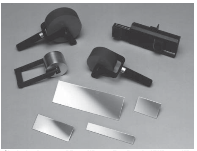
Clockwise from top: PF-90, HR-100, Test Panels, UWF-100, HR-102

PF-90 Peel Fixture: Clamps in jaws of tensile tester machine for quick and easy 90° peels. The PF-90 uses a standard 2"x6" (5cm x 15cm) test panel. Precision bearing assembly allows for smooth sliding action.