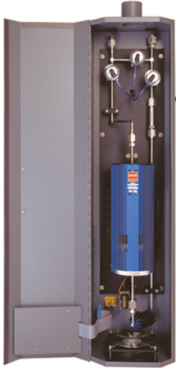
PS15-MT15 For CDA or O 2 , 50 slpm