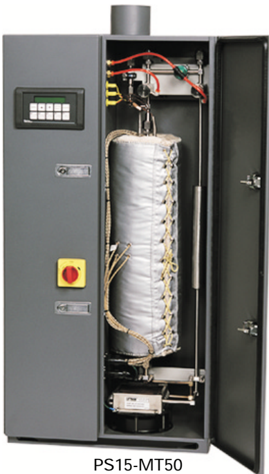
PS15-MT50 For CDA or O 2 , 100 slpm