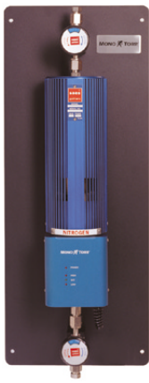
PS15-MT3 For CDA or O 2 , 10 slpm