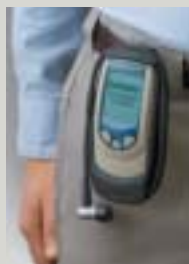
Flip Display enables right-side-up viewing whether the gage is in your hand, on your belt or on a work table