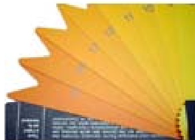
Yolk color fan