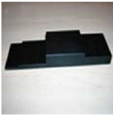
Calibration testing jig

Accessories related to egg testing devices such as Sliding plates, Calibration testing jig, Yolk color fan, Printer paper roll and others are also available to our customers. Our Calibration Test Kit includes 100g weight, Calibration testing jig and Yolk color fan.