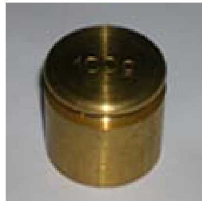
100 g weight