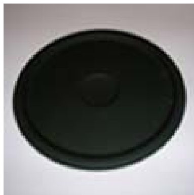
Sliding (Testing) plate