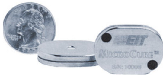
MicroCure® Radiometer, 2 Watt MicroCure® Radiometer, 10 Watt