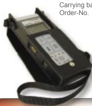
Carrying bag Order-No. 3 749 680