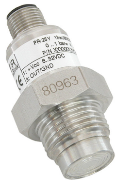
Series 25 Y

A modular concept is used, with fast and economical production achieved by using off-the-shelf sensors. Numerous options and variations are available to meet customers' specific requirements: Pressure ranges, pressure ports, signal outputs, electrical connectors, etc.