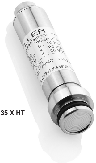
Series 35 X HT

With the KELLER software READ30 and PROG 30, a RS485 converter (i.e. K-102, K-104 or K-107 from KELLER) and a PC, the pressure can be displayed, the units changed, a new gain or zero set. The analog output can be set to any range within the compensated range.