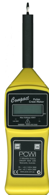
Pulse Crest Meter