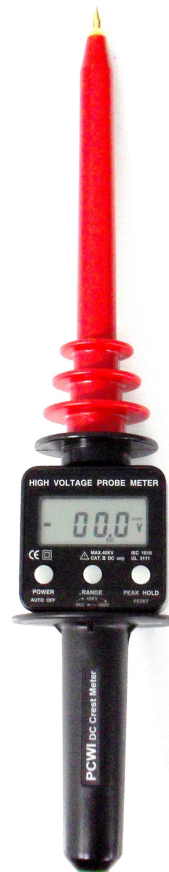
DC Crest Meter