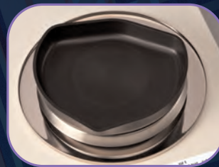
Chain Pan Part #2991