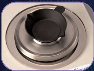
Carat Pan Part #7621