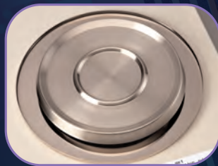
Gem Pan Part #7260