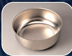
Bowl Part #11931