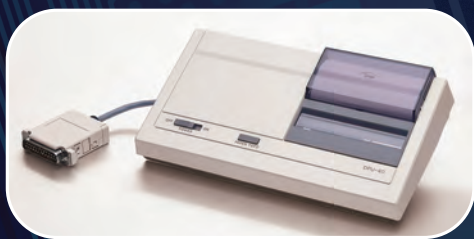
Thermal Printer Part #7000-42